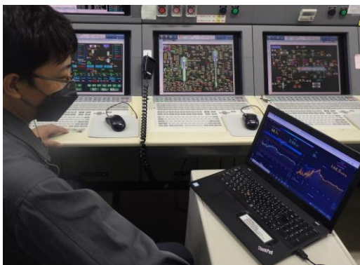
↑AI System in Use